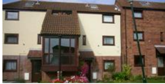
Frosthole Close, Fareham

You told us that you would like to see more rented housing built by housing associations for local people, that there should be more opportunities for first time buyers and an increase in the provision of private rented accommodation.