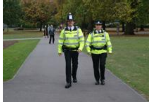
Police on the beat

You said that a low level of crime is the most important issue in making Fareham a pleasant place to live.