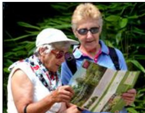
Walking to health

A borough where all its residents are enabled to live longer, fitter and healthier lives.