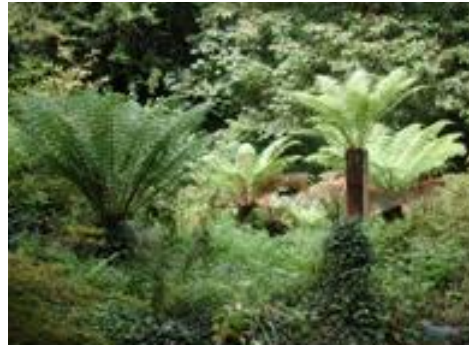
Holly Hill Woodland Park

You said that improving traffic conditions, public transport and roads and pavements are top priorities.