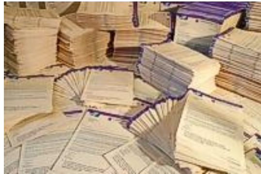
A pile of questionnaires

Most residents are satisfied with local leisure and social facilities. Community facilities, youth centres and sports facilities are generally well used.